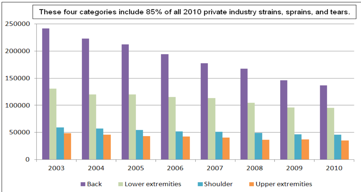
Chart B. Number of sprain, strain, and tear cases requiring days away from work by selected part of body, private industry, 2003-2010

Musculoskeletal disorders. Musculoskeletal disorders (MSDs), often referred to as ergonomic injuries, accounted for 29 percent of all workplace injuries and illnesses requiring time away from work in 2010. (See table 18.) A list of nature of injury or illness and event or exposure categories that comprise musculoskeletal disorders can be found on the BLS website: http://www.bls.gov/iif/oshdef.htm .